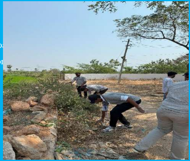
Student volunteers cleaning up local area