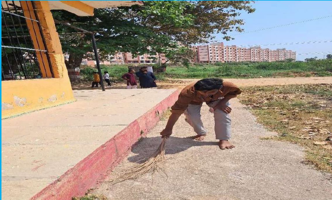
Student volunteer cleaning temple local premises

By the afternoon, the temple cleaning task was successfully completed, thanks to the dedication and hard work of the volunteers. The transformed temple stood as a testament to their collective effort and served as a tangible reminder of the power of unity in fostering positive change within our communities.